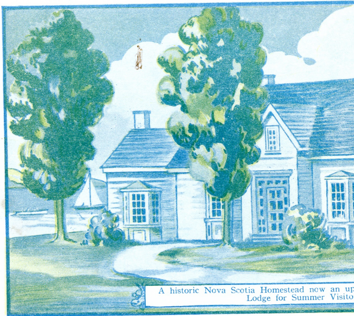
A historic Nova Scotia Homestead now an upland Lodge for Summer Visitors